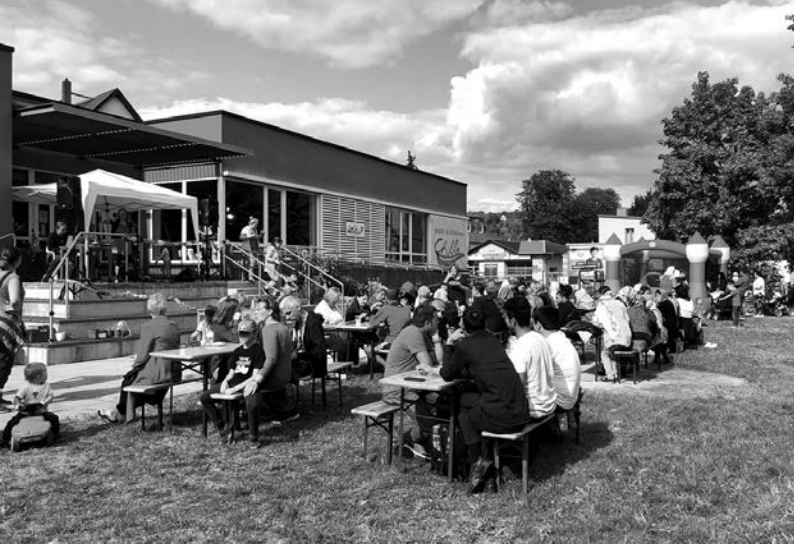
Intercultural family festival run by Laubegast ist bunt e. V.