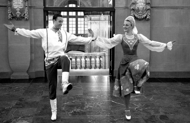
Performance by a Russian dance group in cooperation with Deutsch-Russisches Kulturinstitut