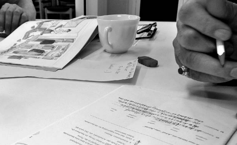
German language workshop