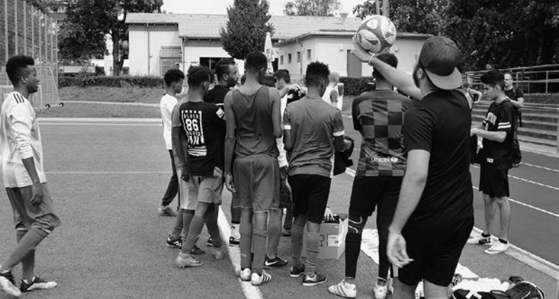
International football meet-up by Willkommen in Löbtau e. V.

8 p.m. Club Passage, Leutewitzer Ring 5 lecture The Silk Road – cycling adventures en route to China