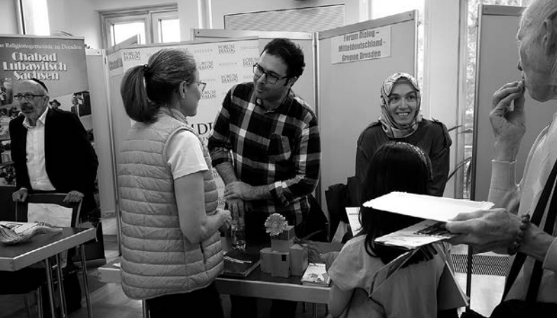
Information market for the 2019 Children of Abraham peace festival