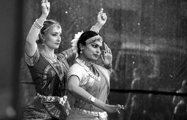
Sanskriti Dresden