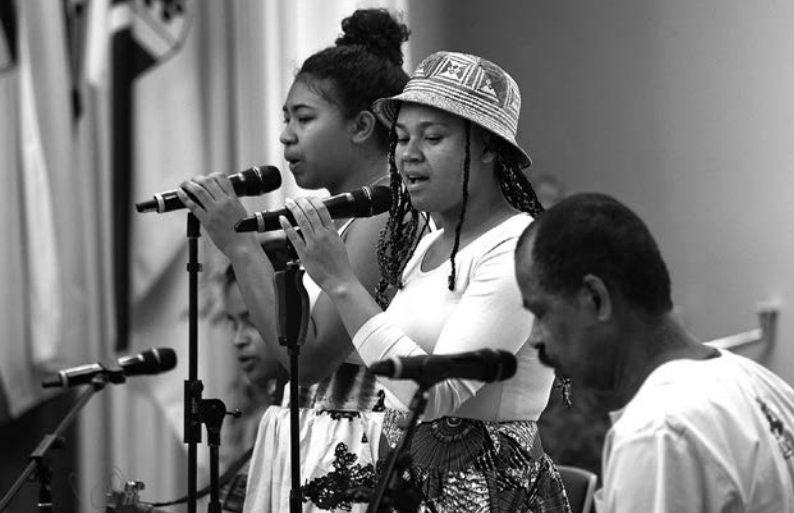
Madagask'ART artists' group at the opening of the Intercultural Days in 2019