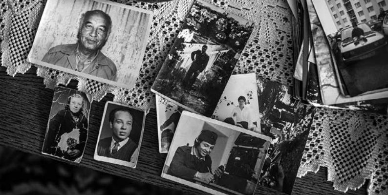
Memories of a Roma family