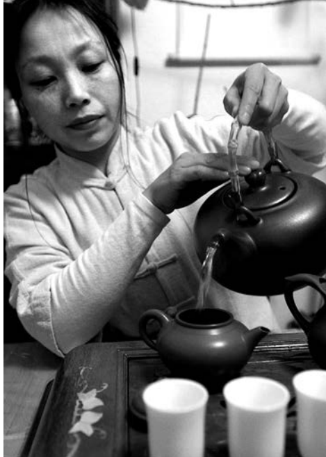
Traditional tea ceremony |

Photograph: Chinesisch-Deutsches Zentrum e. V.